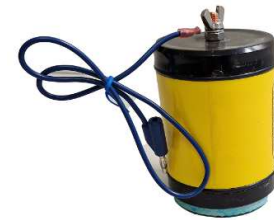
Non-polarizable electrode Cu - CuSO_4 500 g – 13 cm – 8 cm diameter