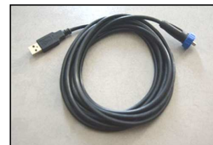
USB - USB link

Specifications subject to change without notice BR_ACC_GC_GB_V4