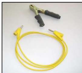
Cord with clip for reel to big size electrode