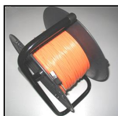
750 m length wire 20 kg