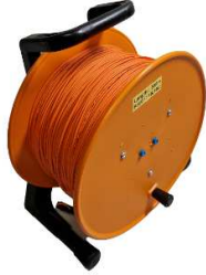
250, 350 and 500 m length wire 4.3 – 5.8 and 7.8 kg