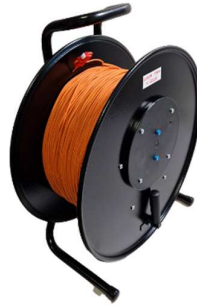
750 m and 1000 m length wire 19 and 23 kg