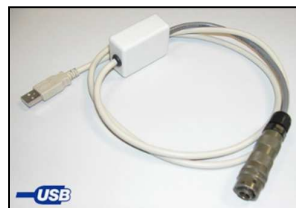
RS232 - USB link