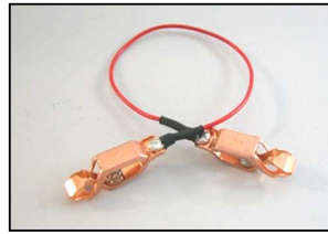
Cord clip for switch cable output to small size electrode