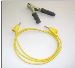
Cord with clip for reel to big size electrode