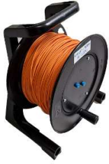
50 and 100 m length wire 1.8 and 2.6 kg