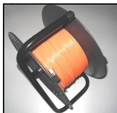
100 and 150 m length wire 2.8 and 3.6 kg