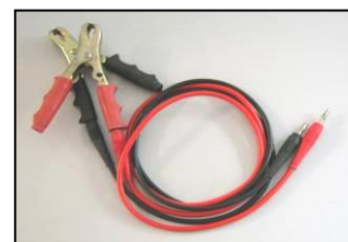
Cords with clips for unit to external Tx battery