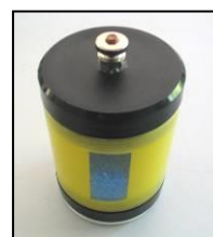
Non-polarizable electrode Cu – CuSO 4 500 g – 13 cm – 8 cm diameter