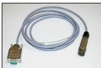
RS232 Serial link