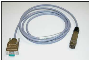
RS232 Serial link