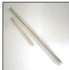
Stainless steel electrodes small size: 250 g – 40 cm – 12 mm diameter big size: 1 kg – 60 cm – 18 mm diameter