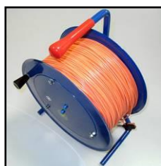
250, 350 and 500 m length wire 8 – 9.6 and 11.8 kg