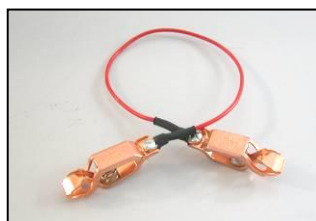
Cord clip for switch cable output to small size electrode