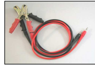
Cords with clips for unit to external Tx battery