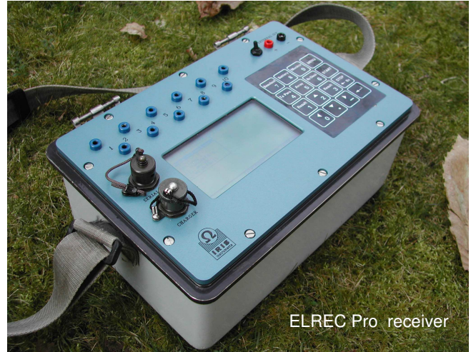
ELREC Pro receiver