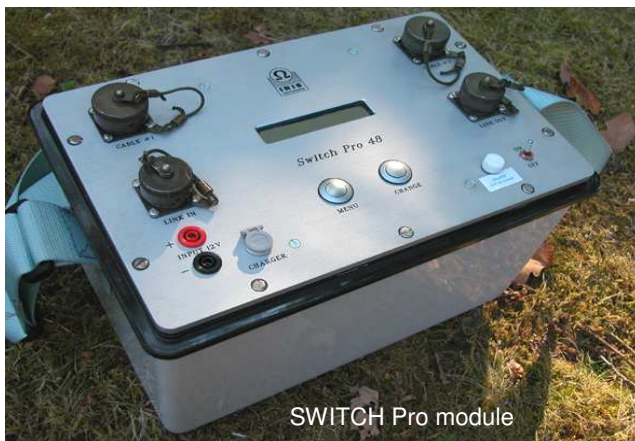
SWITCH Pro module