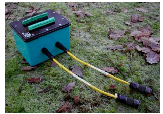
Termination strip box for SWITCH Pro 48 module