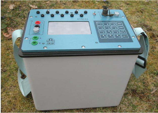
SYSCAL Pro unit