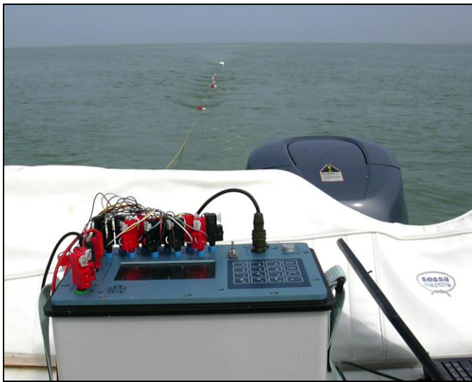
Graphite electrodes floating cable connected to SYSCAL Pro DM unit

The standard spacing between takeout is 4 meters ; cable with other spacing can be supplied to match your requirements.