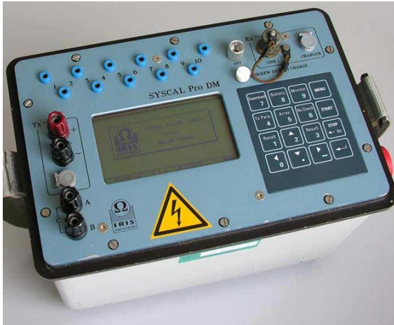
SYSCAL Pro Deep Marine unit